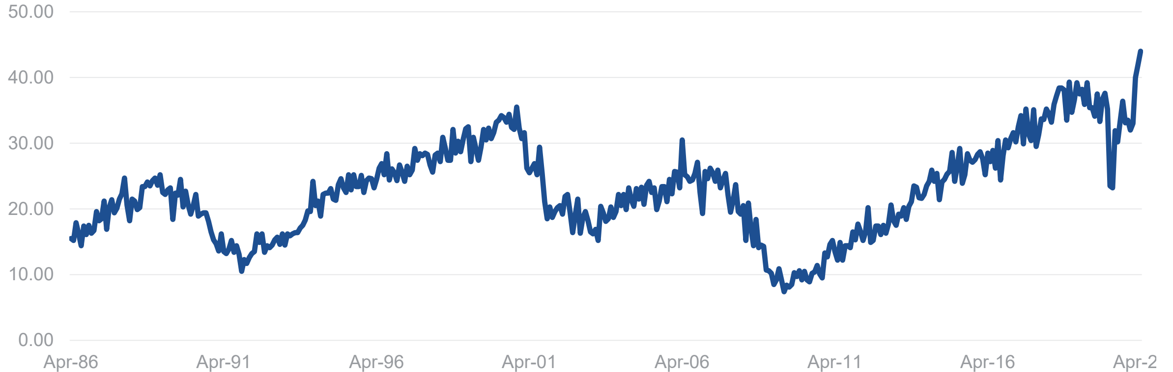
Businesses with tough to fill job opening(s) (% , SA)